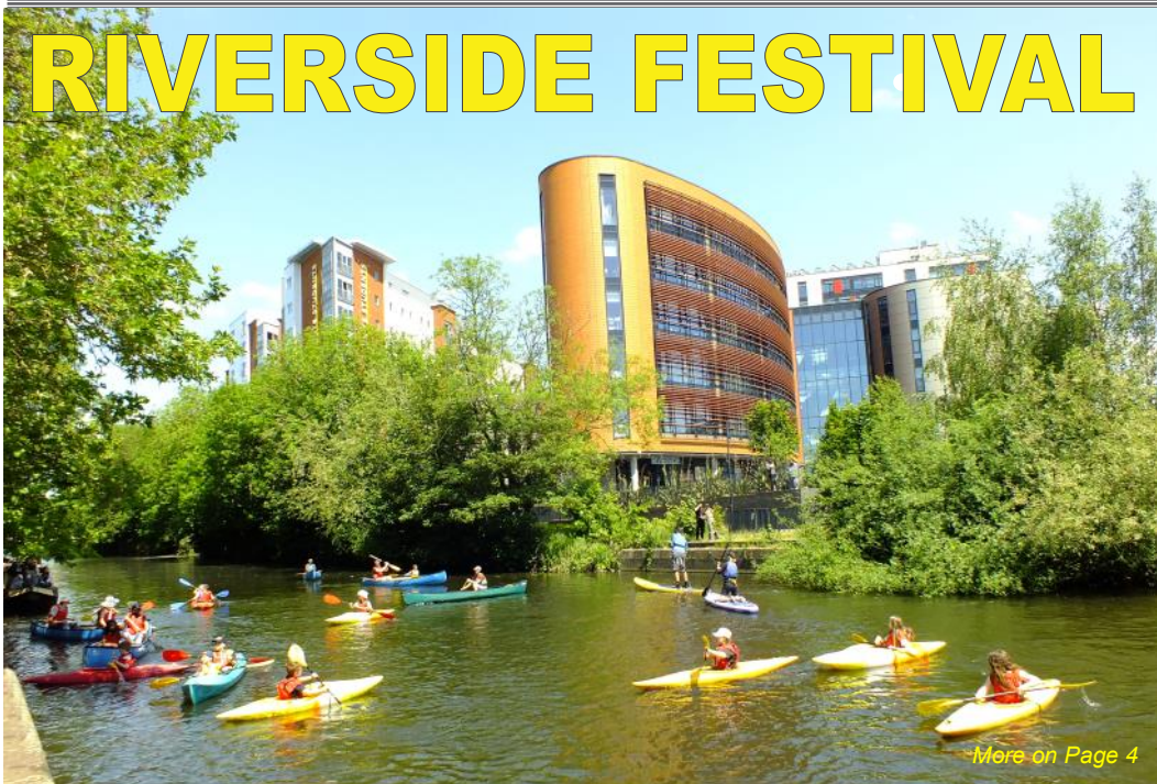
More on Page 4