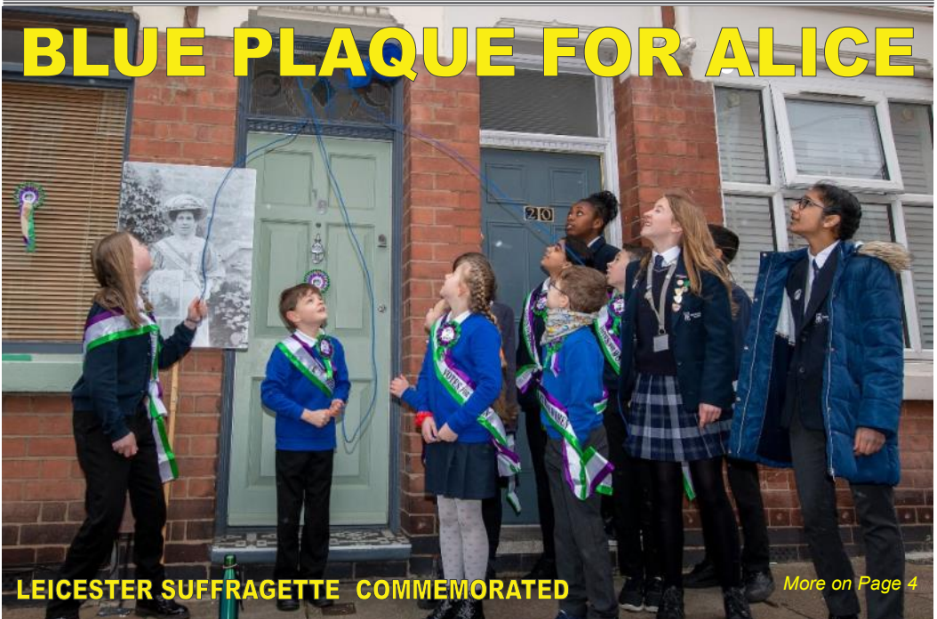
LEICESTER SUFFRAGETTE COMMEMORATED