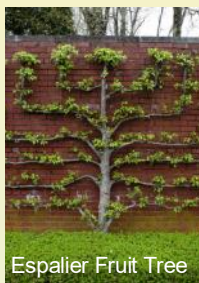
Espalier Fruit Tree

In addition, I have been pruning wisterias. The growth can be left unchecked, but I find that they