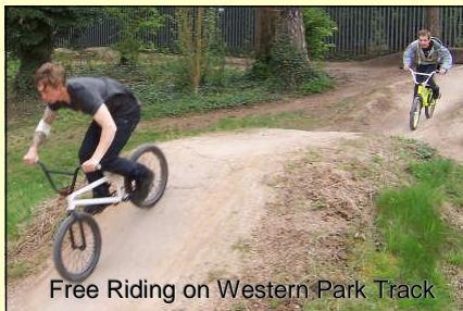
Free Riding on Western Park Track

The club have the backing of the council and several cycling organisations and are committed to reducing crime and anti social behaviour in the area by involving young people in a fun sport and teaching them to look after their surroundings for everyone's benefit.