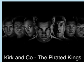
Kirk and Co - The Pirated Kings

Governments around the world are tackling illegal file sharing with fines. Since the technology isn't illegal, but using it to download copywritten material is - it's you who run the risk of a fine if you press the download button.