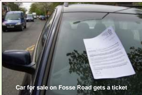
Car for sale on Fosse Road gets a ticket

They have been working across Leicester in eleven wards for the last year and have had considerable success with removing fly-posters and getting people to take their bins off the streets.