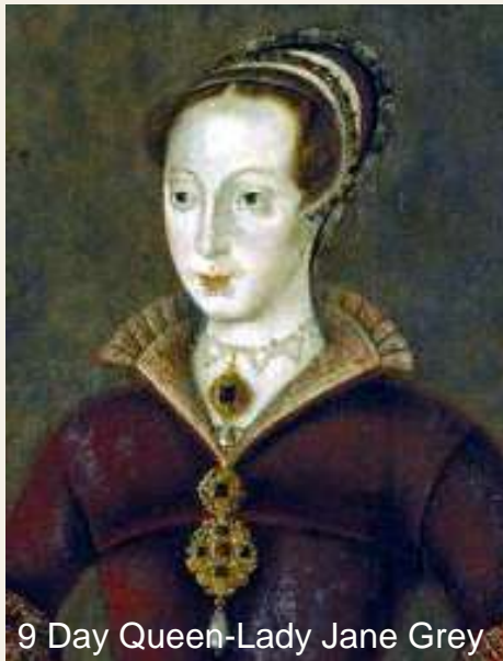
9 Day Queen-Lady Jane Grey

Drive sometime in the early seventies and also welcoming her to the National Space Centre a few years ago when I was Leader of the Council No doubt it will not be too long before the newest royal newly weds make an official visit to our City.