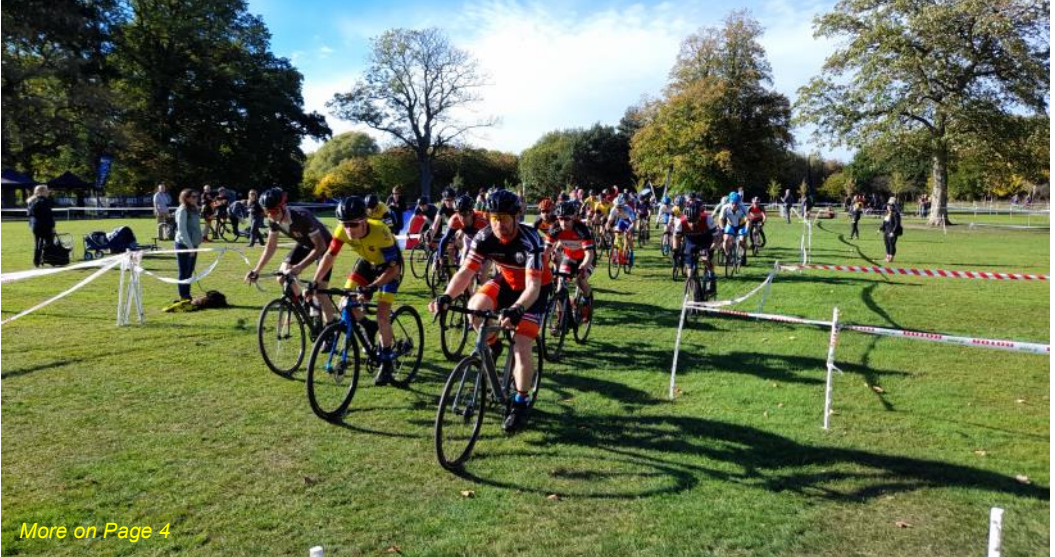
More on Page 4