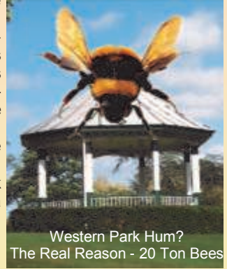
Western Park Hum? The Real Reason - 20 Ton Bees

your own ears make) or my personal favourite, colliding waves. Yes, scientists have registered infrasonic sounds made by waves colliding and crashing into the ocean floor off... wait for it... the North West coast of the USA and they could be traveling all over the globe, all the way to Leicester!