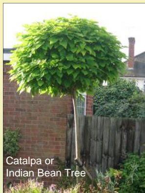
Catalpa or Indian Bean Tree

An excellent tree for small gardens if pruned regularly