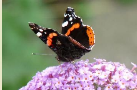
Red Admiral in A Western Park Garden

Over 187,000 butterflies were spotted by 10,000 people across the UK as they carried out 15 minute searches of gardens, parks and window boxes.