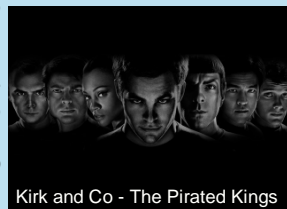
Kirk and Co - The Pirated Kings

Governments around the world are tackling illegal file sharing with fines. Since the technology isn't illegal, but using it to download copywritten material is - it's you who run the risk of a fine if you press the download button.