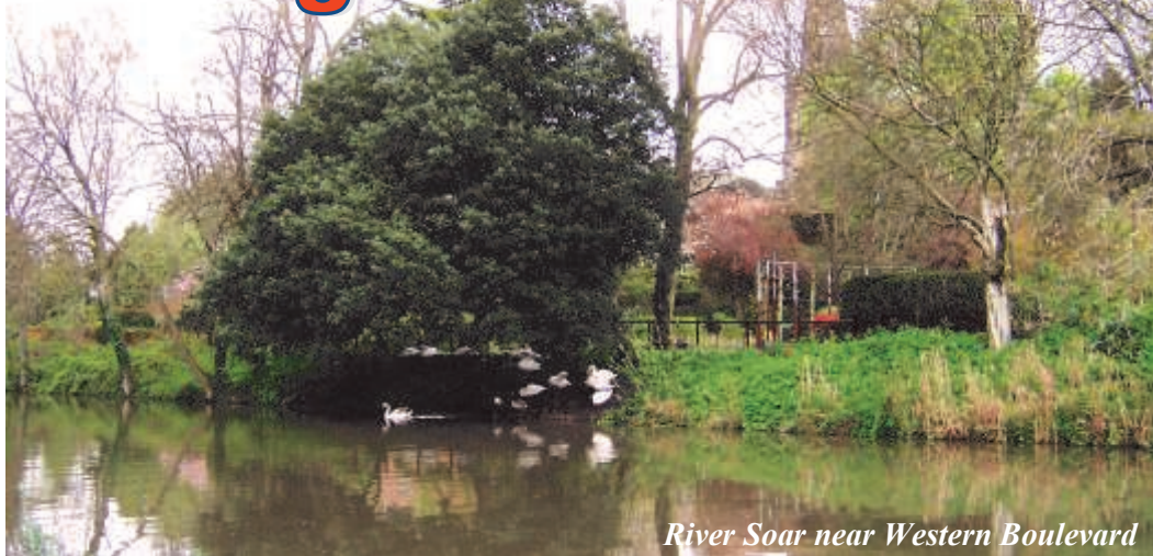
River Soar near Western Boulevard