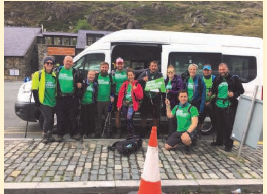
If you would like to donate visit: justgiving.com and search for 'thethreepeakschallenge2018'

"We are currently at £3,822 which will fund 136 hours of Macmillan home nurse care or keep a support centre open for 17 days".