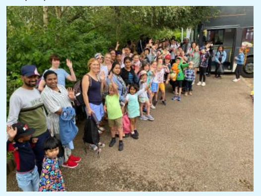
It's completely not for profit, so people pay for the group saver Conkers entry and the cost of the bus

After a couple of conversations with people without car access about how it's nigh on impossible to get to somewhere like Conkers from around here, I thought I would try and do something about that. It's very much a token effort as I only arrange something once a year (I'm trying to lobby the Council to help do more), but we did this for the first time in 2022 with one bus. Then last summer we had two buses with close to 140 people booked on.