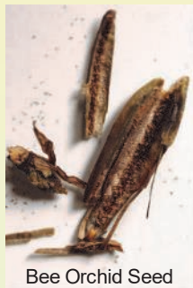
Bee Orchid Seed