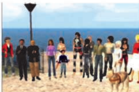
Learn how to use virtual worlds, video games and social media to benefit your community.

Experts from the European Games Industry and Community Media specialists will be showing you how you can make the most of your creative talents to benefit your community.