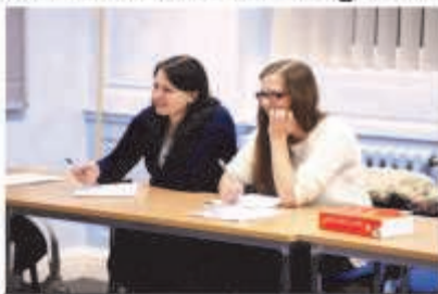
Free English Classes at DMU.

If you would like to sign up for Threadworks or free English classes, please contact the Mile 2 team on 0116 257 7102 or email mile2@dmu.ac.uk .