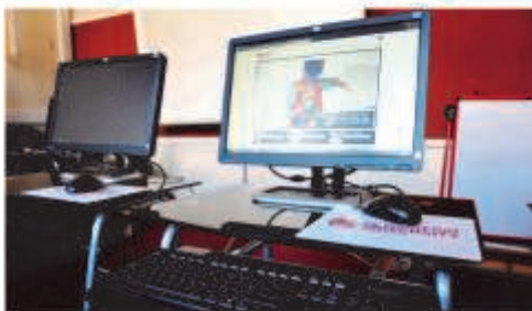
Mile 2 has a purpose built IT suite in Fosse.

A new range of computing courses will be available from the Mile 2 Fosse Neighbourhood Centre IT suite, thanks to the formation of a working partnership between Mile 2 and the Workers Educational Association (WEA). WEA offers a variety of programmes ranging from computing skills to languages and literature courses free of charge to residents who are unemployed or on low income backgrounds.