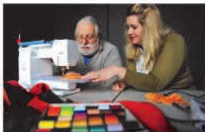
Extra classes for Threadworks.