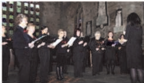
The Mile 2 Choir performed at St Mary De Castro.