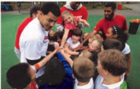
Leicester Rider Coaches will help train young people.

The Mile 2 Team has places for up to 60 young people to take part in weekly basketball coaching sessions on De Montfort University Campus.