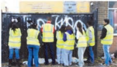
Mile 2 clean-up in Woodgate, Frog Island.

However, Mile 2 also takes part in clean-up sessions within the square mile area with the help of residents and De Montfort University student volunteers.