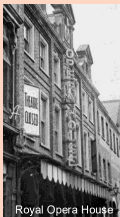
Royal Opera House