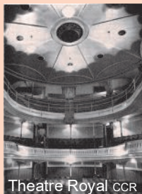
Theatre Royal ccr

The Royal Opera House in Silver Street was also founded in the nineteenth century and for a time became hugely popular. Gilbert and Sullivan operas were regularly performed to packed audiences and so were plays by George Bernard Shaw. In 1901, the Palace Theatre of Varieties opened