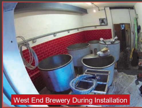
West End Brewery During Installation