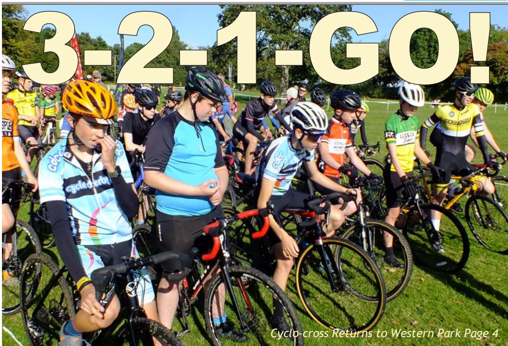
Cyclo-cross Returns to Western Park Page 4