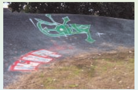
One angry Tudor Road resident says: "They've only just finished building it up and now look at it! Some I've seen on it aren't kids either."

The council hope the improvements will make the Rally a more enjoyable and safer place to visit, but the recently revamped BMX trail has already been "tagged" by vandals.