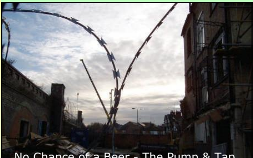
No Chance of a Beer - The Pump & Tap

Written in Western Park Designed in Western Park Printed in Western Park FOR