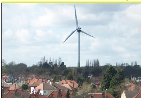
TREMENDOUS VIEW - BUT NOT PRACTICAL

Wind turbines often divide opinion with many opposing them on grounds of noise and viability as an energy source and while many approve of their green credentials.