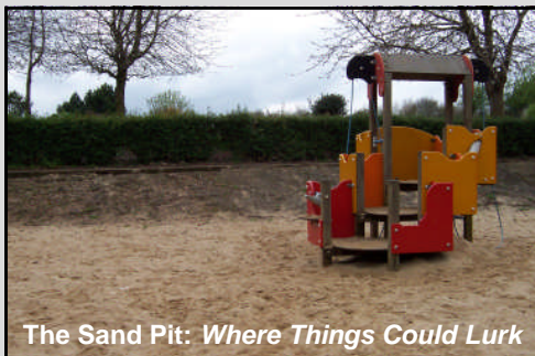
The Sand Pit: Where Things Could Lurk

This doesn't make it easy if you have little kids and older ones though, because you then have to shuttle between different areas of the park while holding