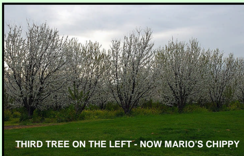
THIRD TREE ON THE LEFT - NOW MARIO'S CHIPPY

Maps of the period show that at the time Leicester had had hardly spread at all west of the River Soar and the whole area was taken up with parkland, gardens and cherry orchards apart from a few dwellings on Braunstone Gate.