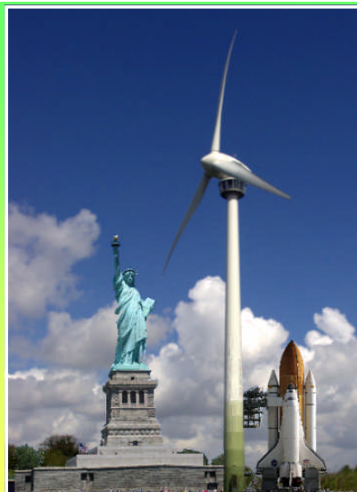
Wind Turbine 137m, Statue of Liberty 93m Space shuttle 56 m. Not to scale. The page isn't long enough!

But what Western Park would have looked like with wind turbine is now a matter for the imagination. So we've used some.