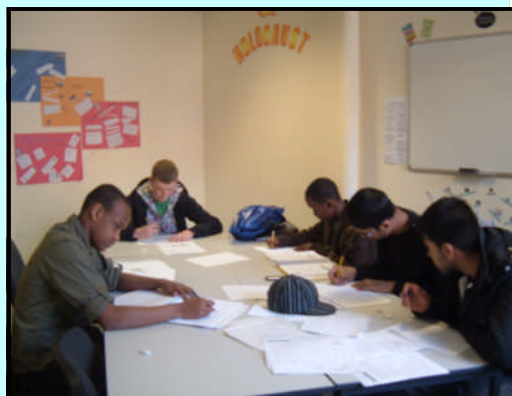
Second Chance Students Hard at Work

For more information call 0116 2614840 or email skomrska@apex-works.co.uk