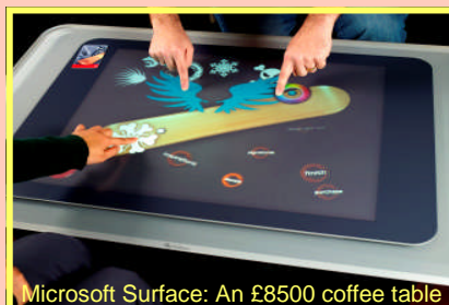
Microsoft Surface: An £8500 coffee table

You could end up on the sofa waving away into thin air to connect to the internet or download your favourite TV show.